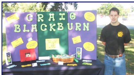
Buddy Walk® 2008

Down syndrome is the genetic condition resulting when a baby is born with three, rather than the usual two, copies of chromosome 21. Because there are three copies of chromosome 21, Down syndrome is also called Trisomy 21. In a small percentage of cases, there is only an additional part of chromosome 21. The cause of the extra chromosome (or part) is still unknown. This extra genetic material affects the cognition and development of the child, but is not a blueprint that determines his or her potential, success or inability to lead a fulfilling, meaningful life.